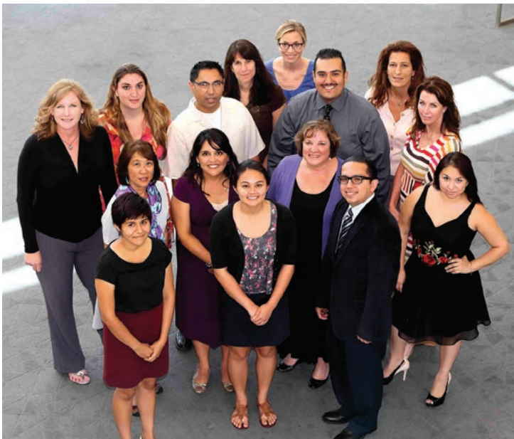
CVEP's workforce excellence team. The need for workers with better skills and education led the organization to take a more comprehensive approach to college and career readiness.

tion attainment among local workers was the major impetus for a more intensive approach. She points to a survey of major companies that indicated 80 percent of their job recruitment was focused on attracting workers outside of the Coachella Valley.